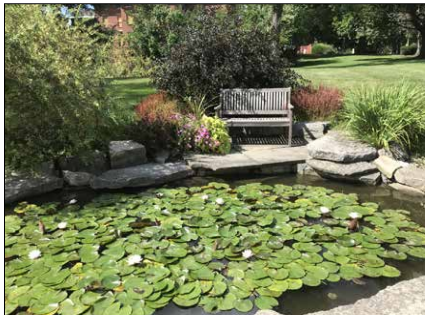
Lovely View of the Fish Pond & Bench

The Women's Park was a very busy place the last several months. Some of the activities that were held in the Park were weddings and wedding photos, birthday celebrations, photos of first birthday milestones, and homecoming groups came for photos on the bridge. July was a hot and rainy month. During one of the downpours our pond pump was damaged, and several fish died. Thanks to Todd Pippenger, we were able to get a new pump quickly and the rest of the fish are doing well.