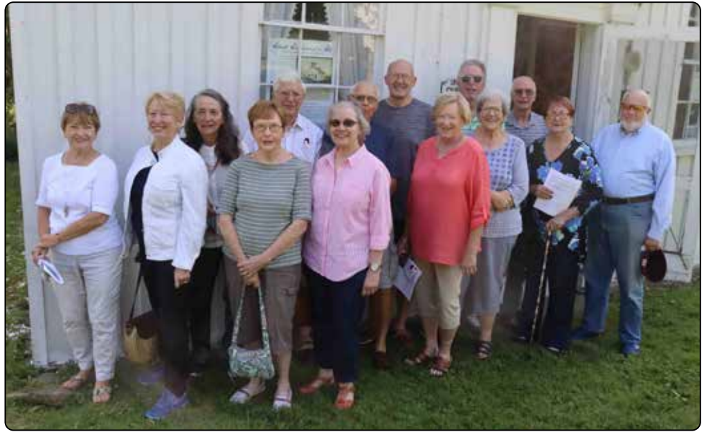
Pictured are Upton Board Members and Friends

After the visit, the group proceeded to Blazin' Bill's BBQ Restaurant for a hearty lunch and fellowship. We were glad to be able to spend time together on a beautiful late summer day.