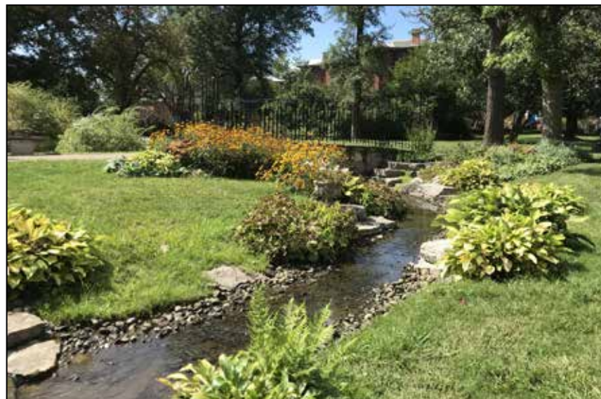
Lovely View of the Stream & Bridge